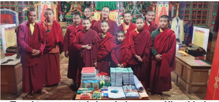
Teaching materials handed over to Kharikhola Monastery School.