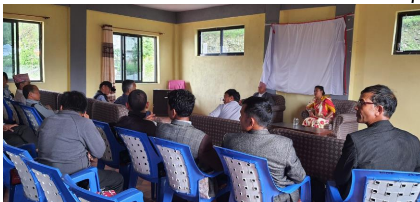
Discussion on annual plan after presentation at Sotang Rural Municipality.