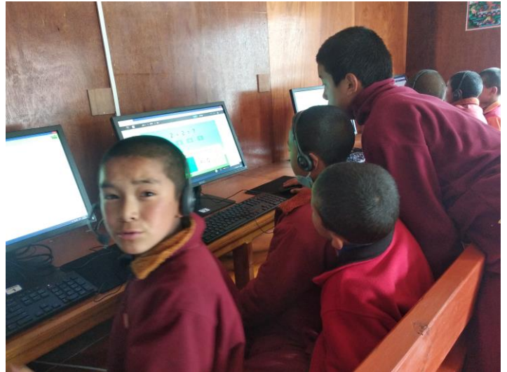
Pema Chholing Monastery School, Rimijung