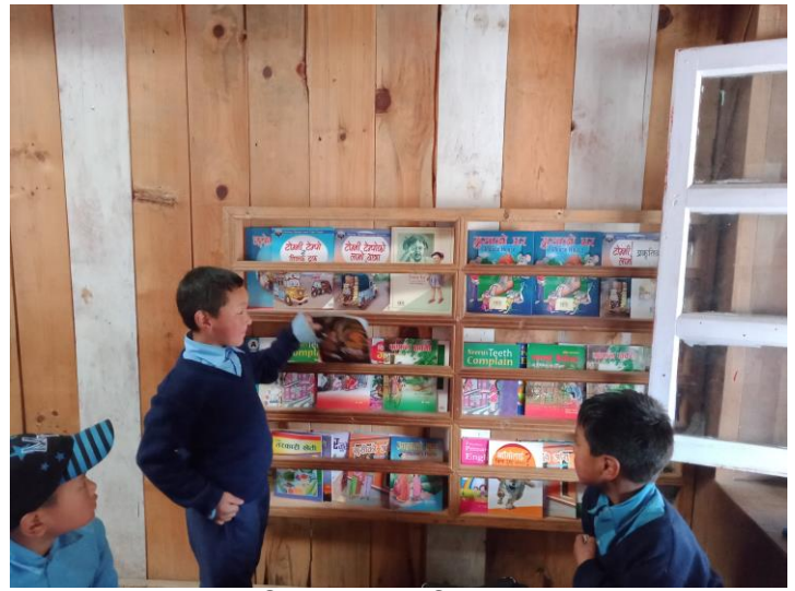
Junbesi Secondary School, Junbesi