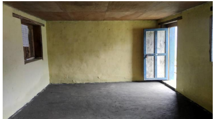
The Completed repair and maintenance work of Saraswati Basic School in Hill.