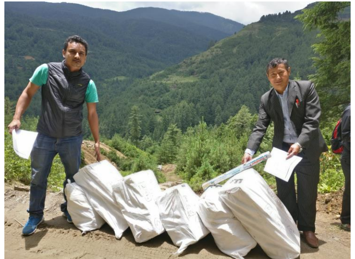
Teaching materials handed over to Junbesi Secondary School, Junbesi.