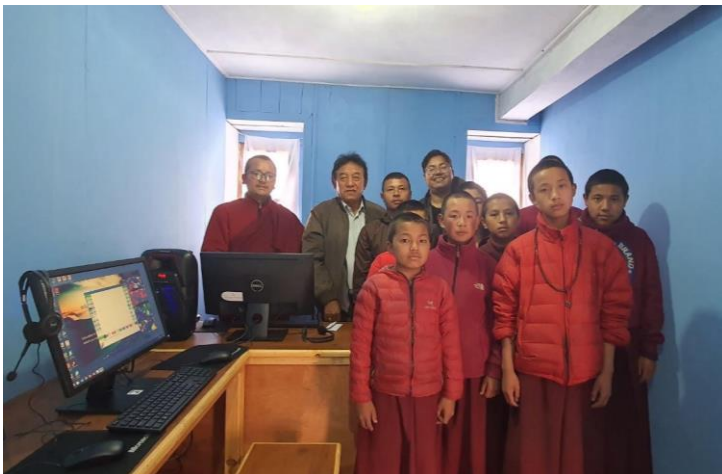
Kemgun Monastery Thanka Painting School, Lukla