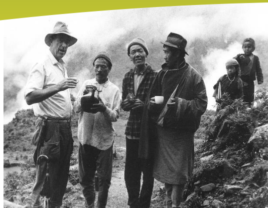
Sir Ed with Sherpas bearing chang and a petition for a school.