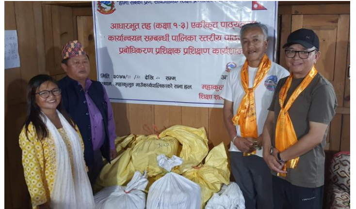
Mahakulung Rural Municipality office.