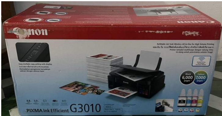
Canon printer handed over to Lukla Kemgun Monastery Thanka Painting School.