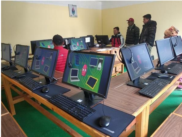
Shree Himalaya Basic School, Namche

The newly set-up computer labs are equipped with branded Dell computers and latest version of teaching materials. Moreover, virtual learning tools have been installed to enhance the learning process in the absence of teachers. The computer labs of 3 schools – Sagarmatha Secondary School, Bung, Singha Kali Secondary School, Tingla and Mahendrodaya Secondary School, Salyan will be installed within August 2022.