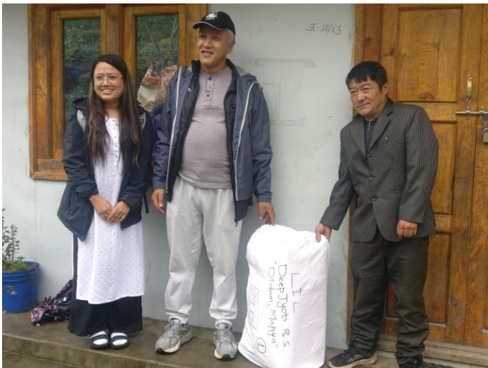
Teaching materials handed over to Dipjyoti Basic School, Didam, Juving.