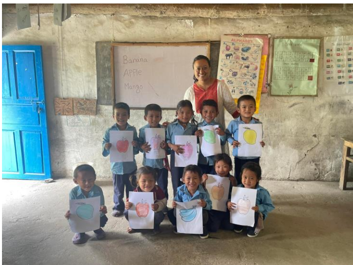
Toshkam Basic School, Sotang.