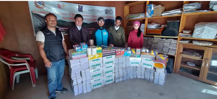
Teaching materials handed over to Takshindu Secondary School, Nunthala.