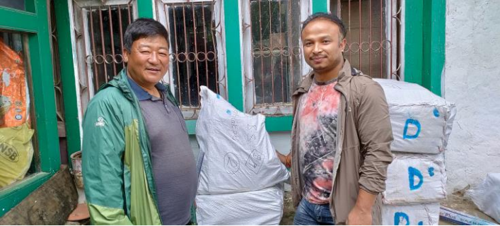
Teaching materials handed over to Kyamje Basic School.