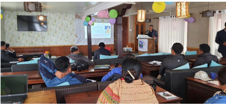
Presentation by CEO at the meeting organized by KPLRM.