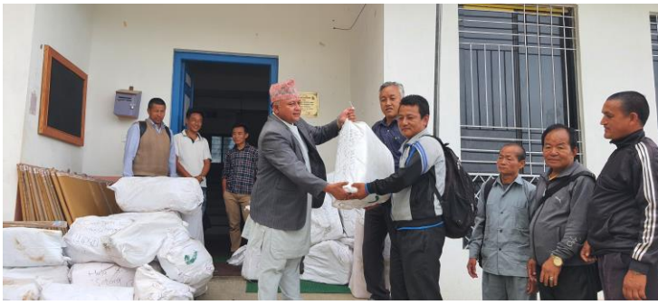
Teaching materials distribution in Sotang Rural Municipality.