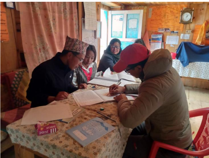
Jwalamai Basic School, Phalamkhani