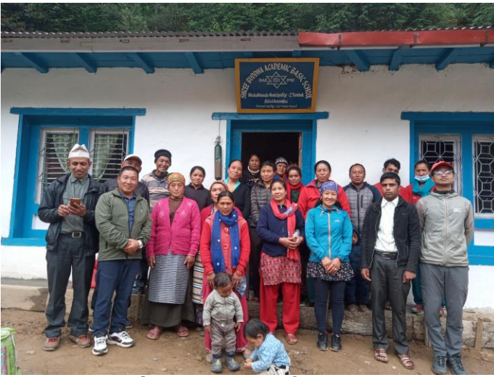
Buddha Academy Basic School, Tumbuk