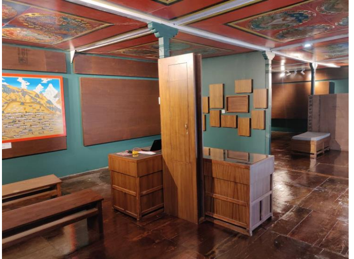
Sir Ed Visitor Center in Khumjung.