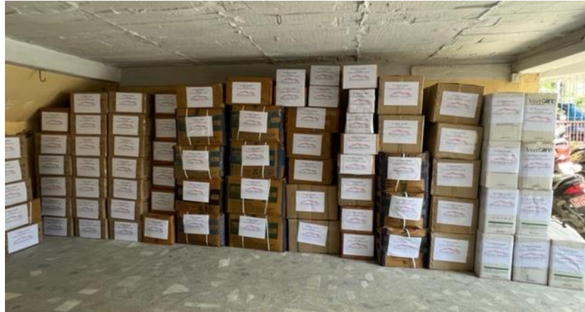
Drugs for Phaplu Hospital ready to transport.

HTN procured necessary drugs for Phaplu Hospital and transported them to the hospital in April 2022 as part of the regular support it provides to the hospital. The procurement was supported by Sir Edmund Hillary Stiftung (SEHF), Germany.