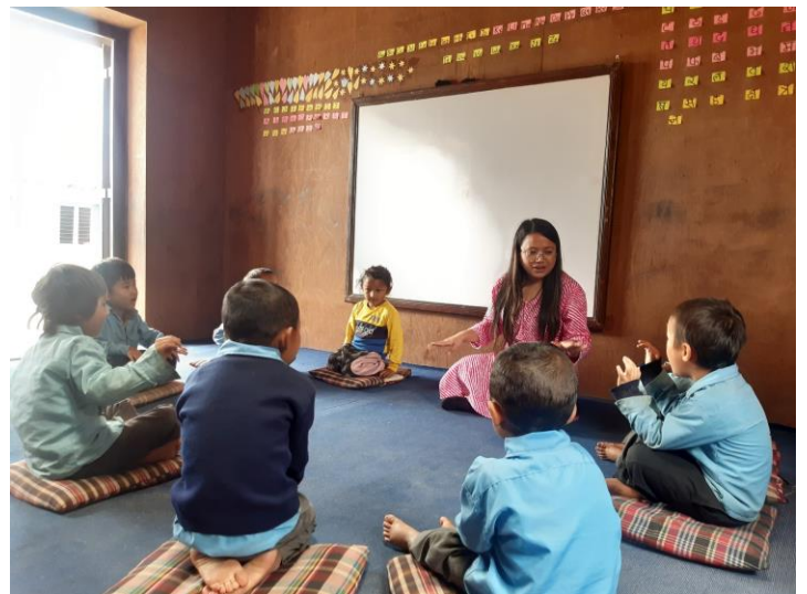
Dudhkoshi Basic School