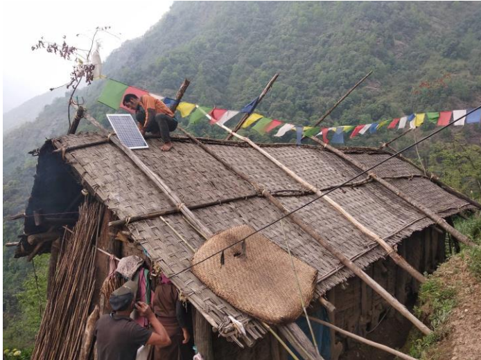
A local family installing solar panel on the rooftop of their house.