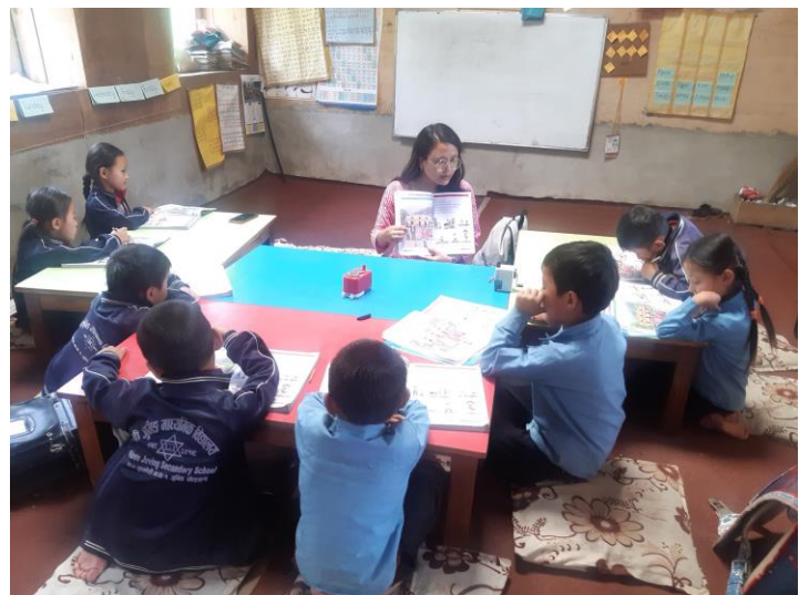
Juvung Secondary School