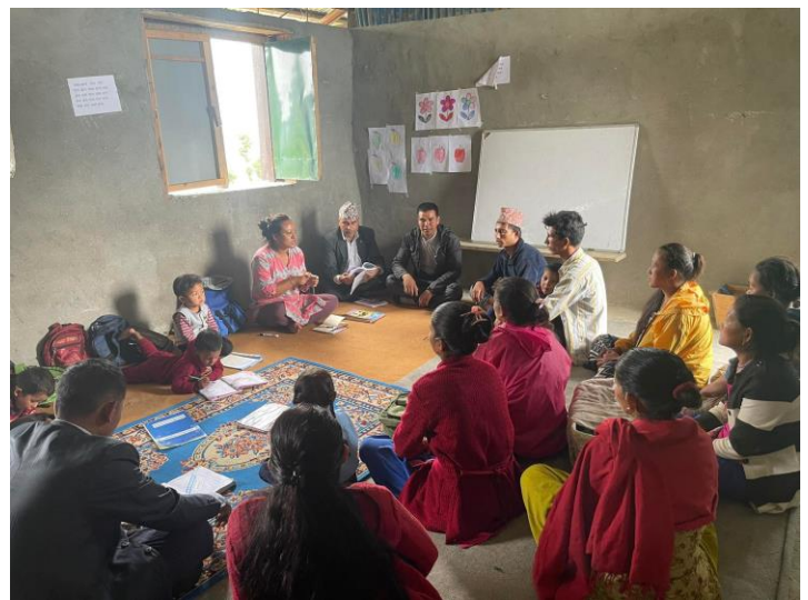
Parents' meeting at Hulu Secondary School.