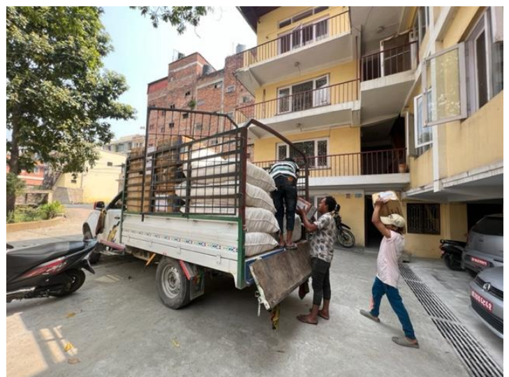
Child-friendly furniture and carpet ready for Solukhumbu departure.