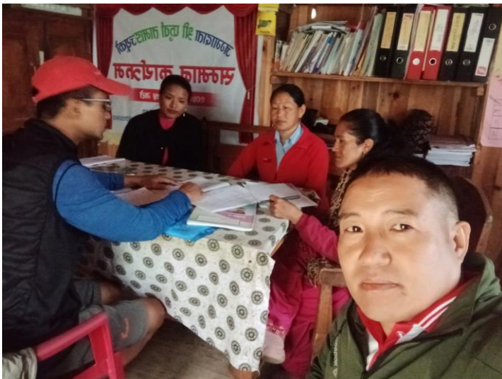
Tenzing Norgay Basic School, Boldo

Mr. Ishwor Man Rai and Mr. Abin Maharjan visited the schools of Solududhkunda Municipality ward no. 2 and 3 schools and carried out literacy support activities such as data collection, classroom observation and feedback, and use of student's evaluation book in June 2022. They also supported in creating School Improvement Plan (SIP) document and observation of reading corner needs.