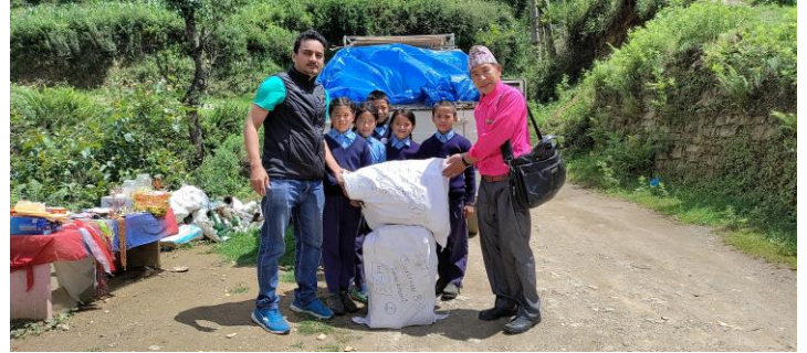
Teaching materials handed over to Jwalamai Basic School, Tamakhani.