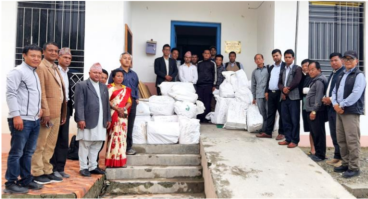
Sotang Rural Municipality office.