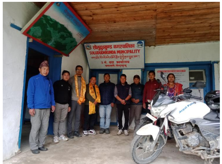
With the representatives of Solududhkunda Municipality ward no. 3.