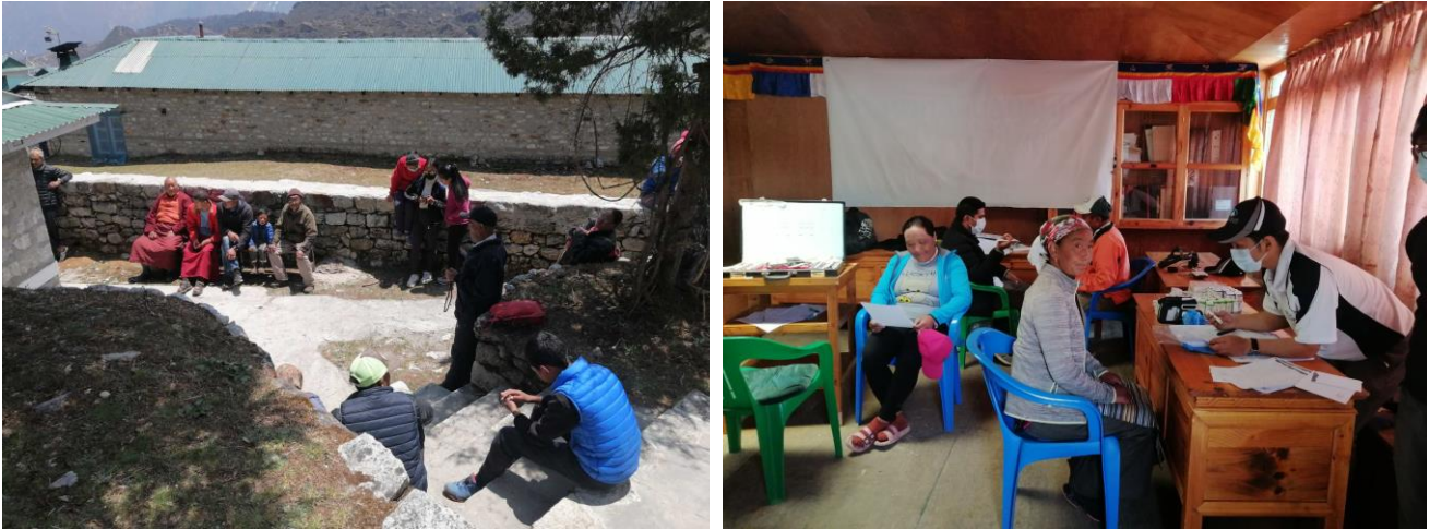
Glimpses of the Eye Camp at Khunde Hospital.

On 28 th April 2022, "Eyes for Everest" held a one day Eye Camp at Khunde Hospital in order to examine eyes of general public. A total of 85 patients got their eyes screened. 55 male and 27 female eye patients received the service. A prescriptions were provided to the patients for correcting refractive error.