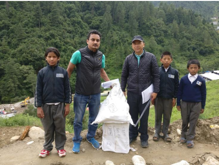
Teaching materials handed over to Beni Basic School, Salabesi.