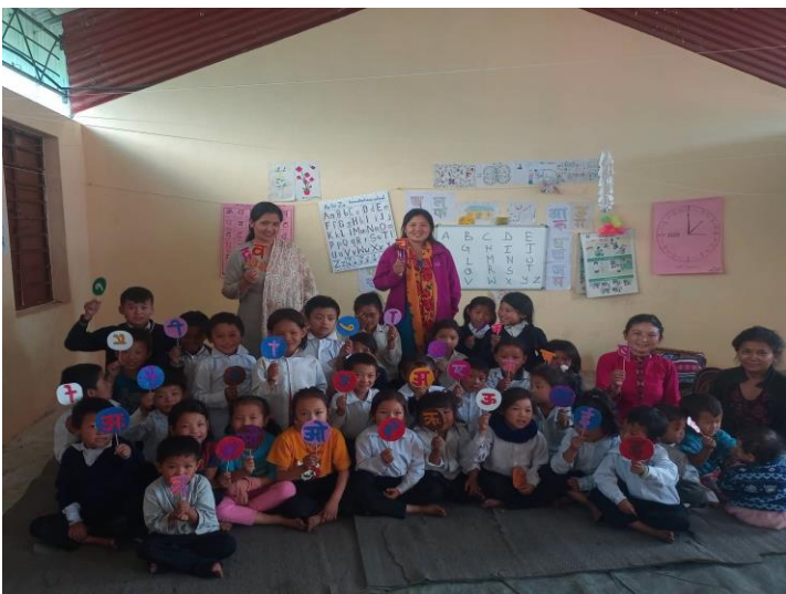
Janasudhar Basic School