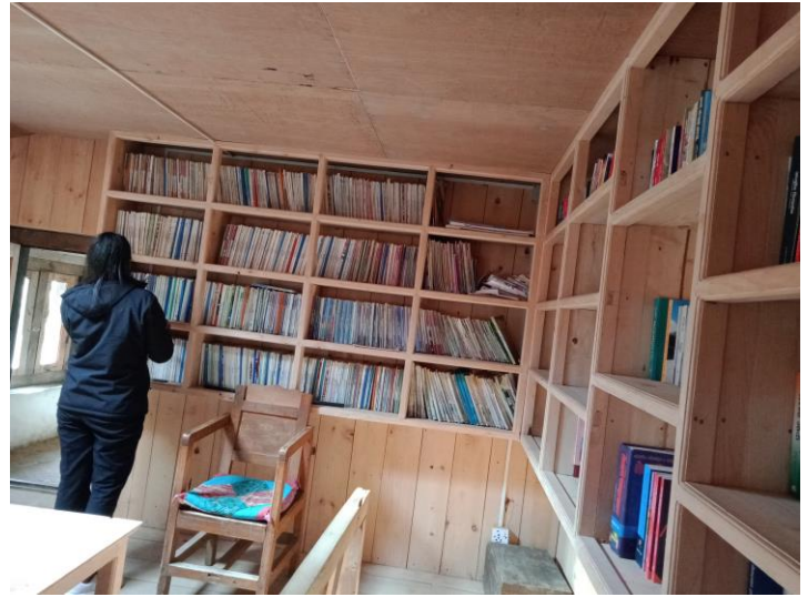
Himalayan Sherpa Buddhist Basic School, Phungmucho