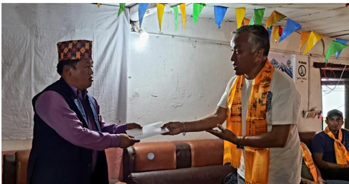
Annual plan handover to Chair of Mahakulung RM.