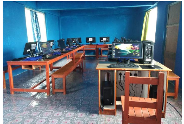
Shree Mahendrodaya Secondary School, Nirmalidanda, Khotang