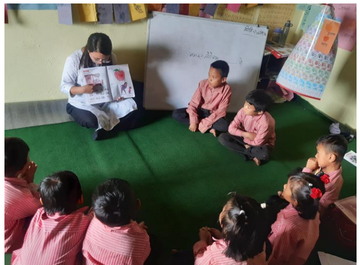
Nava Pragati School