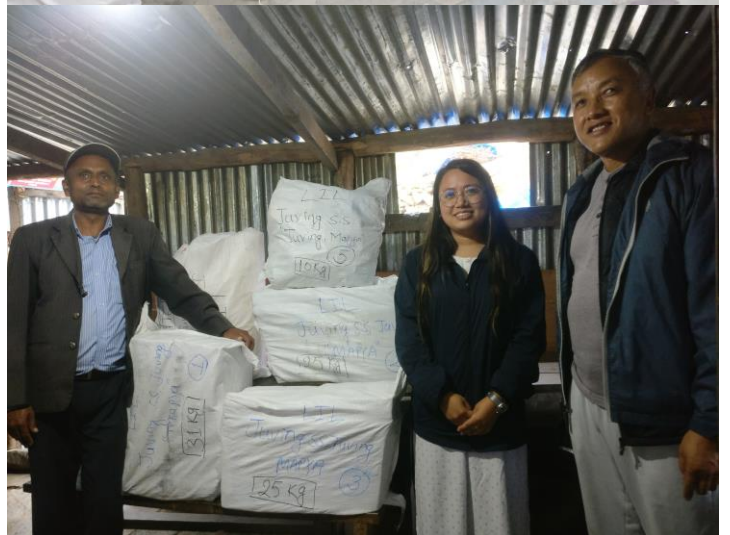
Teaching materials handed over to Juving Secondary School.