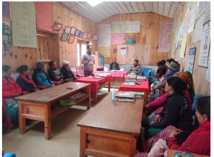
Beni Basic School, Salabesi