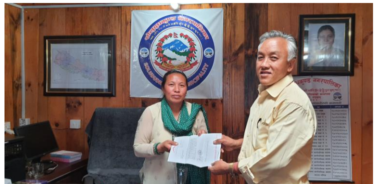
Annual handover to Deputy Mayor of Solududhkunda Municipality.