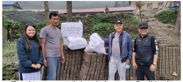
Teaching materials handed over to Dudhkoshi Basic School, Bumburi.