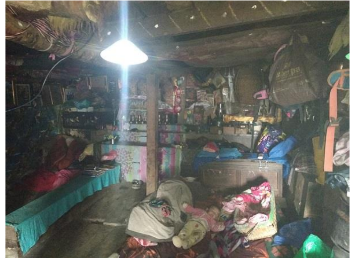
Solar light in use in one of the houses.