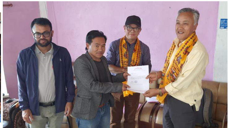
Annual plan hand over to Vice Chair of Mapya Dudhkoshi RM.