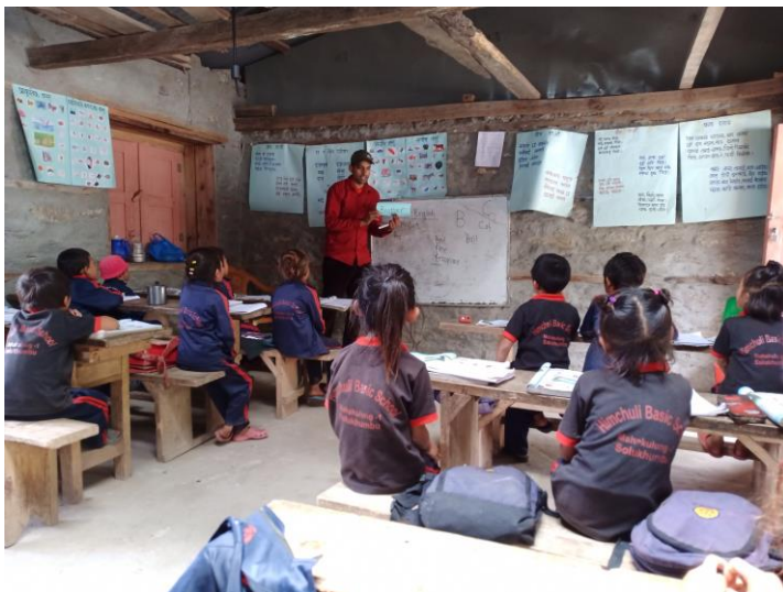
Lesson demo at Himchuli Basic School