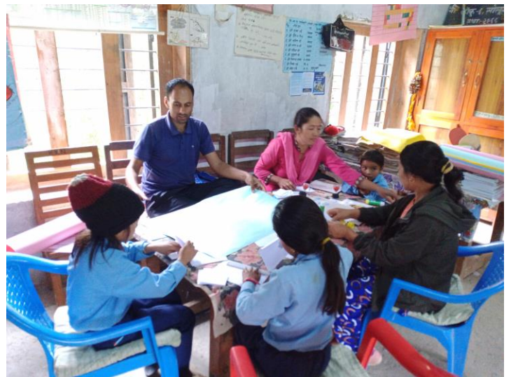
Supporting teachers in classroom management in Devasthan Basic School.