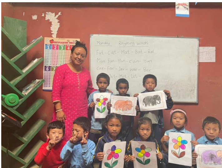
Basuki Basic School, Pawai.

The LIL team is currently visiting schools in order to meet the newly elected representatives of Mahakulung, Mapya Dudhkoshi and Sotang Rural Municipalities and to support in preparation of School Improvement Plan (SIP). During the team's visit, they will be updating the students' records and conducting demo classes. They will also assess model classroom at different schools, help in the students' evaluation process and distribute teaching materials.