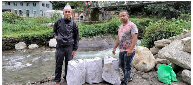
Teaching materials handed over to Buddha Academy Basic School, Tumbuk.