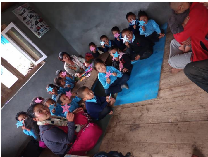
Denam Basic School