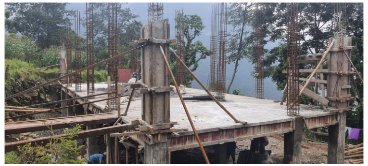
The completed slab and column casting of 1 st floor at Sotang hostel construction project site