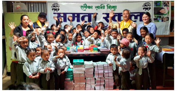
Samata Basic School