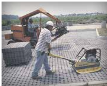
Mechanical installation equipment accelerates construction; typical 5,000 sf (500 m 2 )/machine/day. After placement, joints and/or openings filled with small aggregate and pavers are compacted.