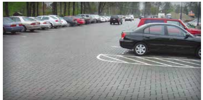
PICP functions as a retention pond and parking lot at the Elmhurst College, LEED® project in Elmhurst, IL, part of an LID sustainable site.