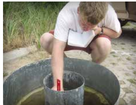
Students can use an infiltrometer (shown at left) to measure surface infiltration as class work.

Meets sustainability goals for campus master plans