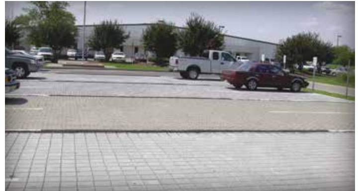
Multiple permeable pavement materials monitored by university students in Kinston, NC.