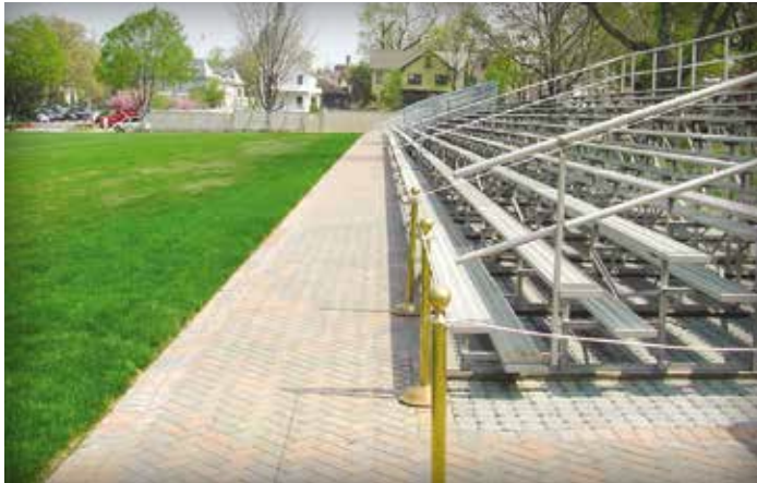
PICP under bleachers at the U.S. Naval Academy in Annapolis, MD provides structural support and on-site infiltration.

PICP makes a useful instructional tool for engineering, architecture, landscape architecture and construction students. The outdoor classroom provides a demonstration site to monitor performance and maintenance aspects and can have a lasting impact on students as they move into their careers.