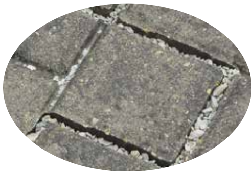
Permeable joint material consisting of small aggregates allows infiltration of stormwater.