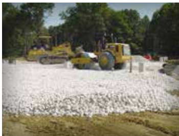
Base construction uses locally available materials. Pavers are delivered ready to place, joints filled, compacted and ready for traffic.