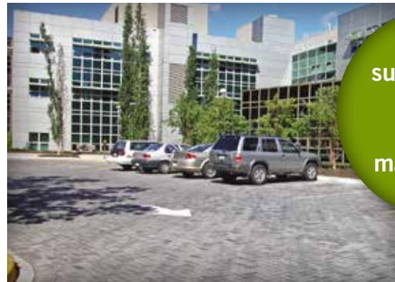
PICP parking lot at University of Victoria, Vancouver, BC treats stormwater and visually unifies the building entryway.

Meets sustainability goals for campus master plans