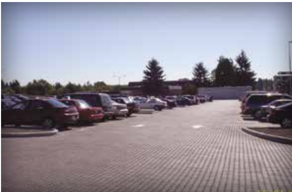
Parking lot treats stormwater and reduces runoff at Tacoma Community College