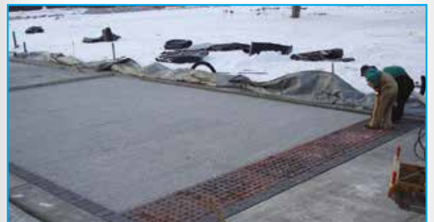
Installation can occur in freezing temperatures over unfrozen subgrade, shown here in Moline, IL.