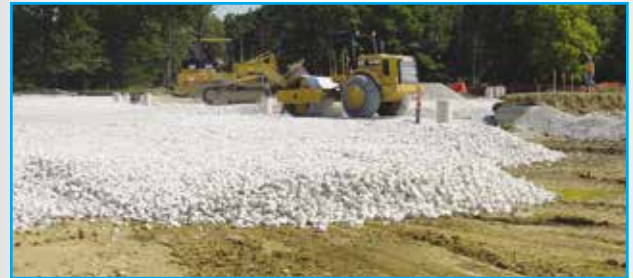
Base construction uses locally available materials.