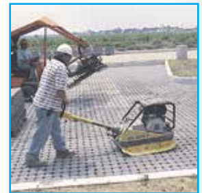
Mechanical installation speeds construction. Aggregate base and subbase are spread and compacted; pavers are delivered ready to install. After placement, joints and/or openings are filled with small aggregate and pavers compacted at this Walmart in Rehobeth Beach, DE.