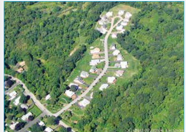
With no detention pond, layout conserves trees while 15,000 sf (1500 m 2 ) PICP in the cul-de-sac returns rainfall to the water table in Glen Brook Green subdivision in Waterford, CT.