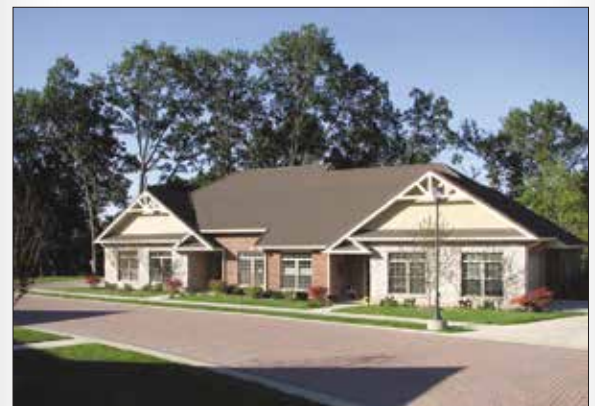
39,000 sf (3900 m 2 ) PICP street in Autumn Trails, Moline, IL eliminated the need for storm sewer inlets and pipes.