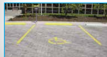
PICP complies with ADA, as shown in this university parking lot in Vancouver, BC.