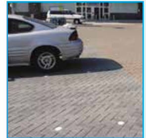
Stormwater treated in drive and parking space areas in Vancouver, BC shopping center.