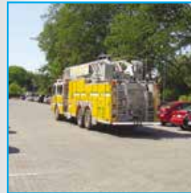
PICP is strong and durable.